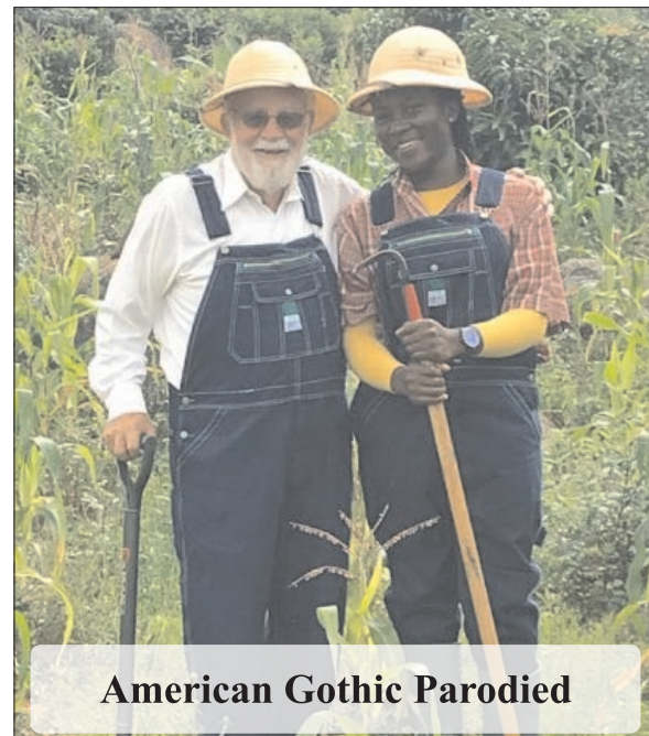
American Gothic Parodied