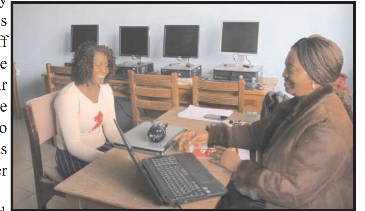
Our new classroom

The Internet and Computer Technology (ICT) Training Center of the School of Biblical Studies has officially opened with 12 computers and one ICT staff member. The purpose of this center is to introduce students to the use of the computer to facilitate their research exercises and to promote scholarship within the brotherhood. Additionally, the ICT unit is also setup to enhance the practical skills of students in the school as well as young people in the neighborhood in computer appreciation.