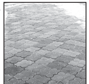
A Plastic Roadway

The picture below shows a few of those bricks that were produced, and now are laid on the road. Though the cost of producing these bricks were a little higher than the usual cement interlocking bricks, the durability of this plastic interlock is far better. Another huge benefit is this project becomes an economic and productive way of cleaning up the environment.