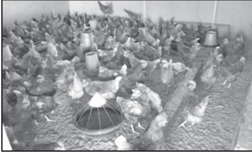
Our layer birds

Our poultry farm is about 16 months old now. We started with 200 layers (those supplied eggs) in May 2019.