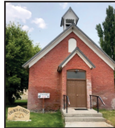
Albion Church of Christ